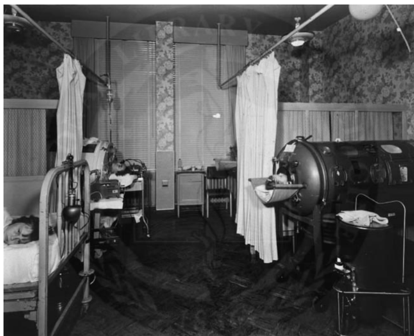
Iron lungs in poliomyelitis ward Latter-Day Saints Hospital Salt Lake City, Utah, 1949