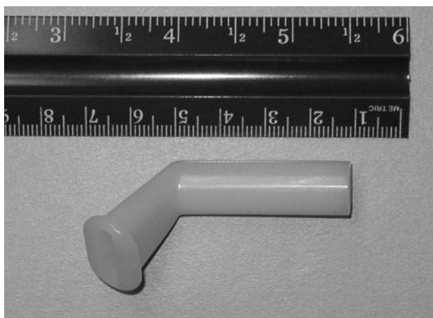
Fig. 1. Mouthpiece with angular restriction and oral flange.